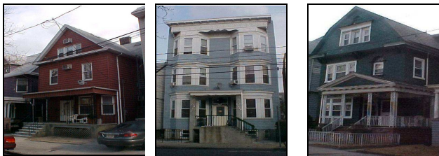
Corpus Christi residences

Jersey City Episcopal CDC 779 Bergen Avenue Suite 214 Jersey City, NJ 07306 201-209-9301